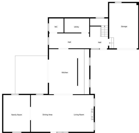
Floorplan Is For Illustrative Purposes Only And Is Not To Scale