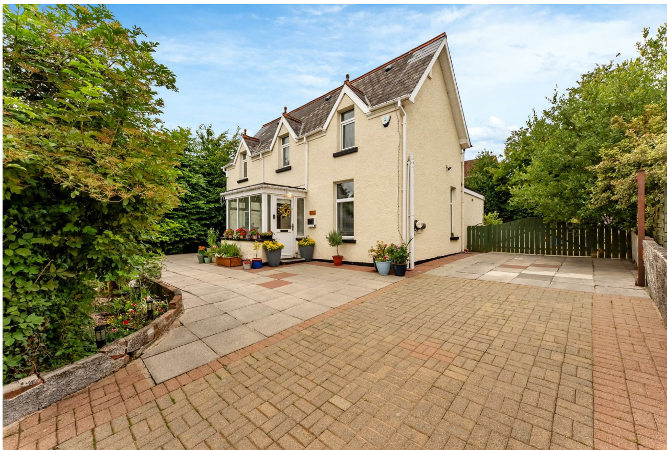
9 Inniscoole Park, Newtownabbey, BT36 6JD