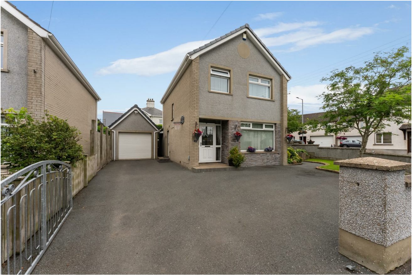
1 George Court, Ballynure, Ballyclare, BT39 9TL