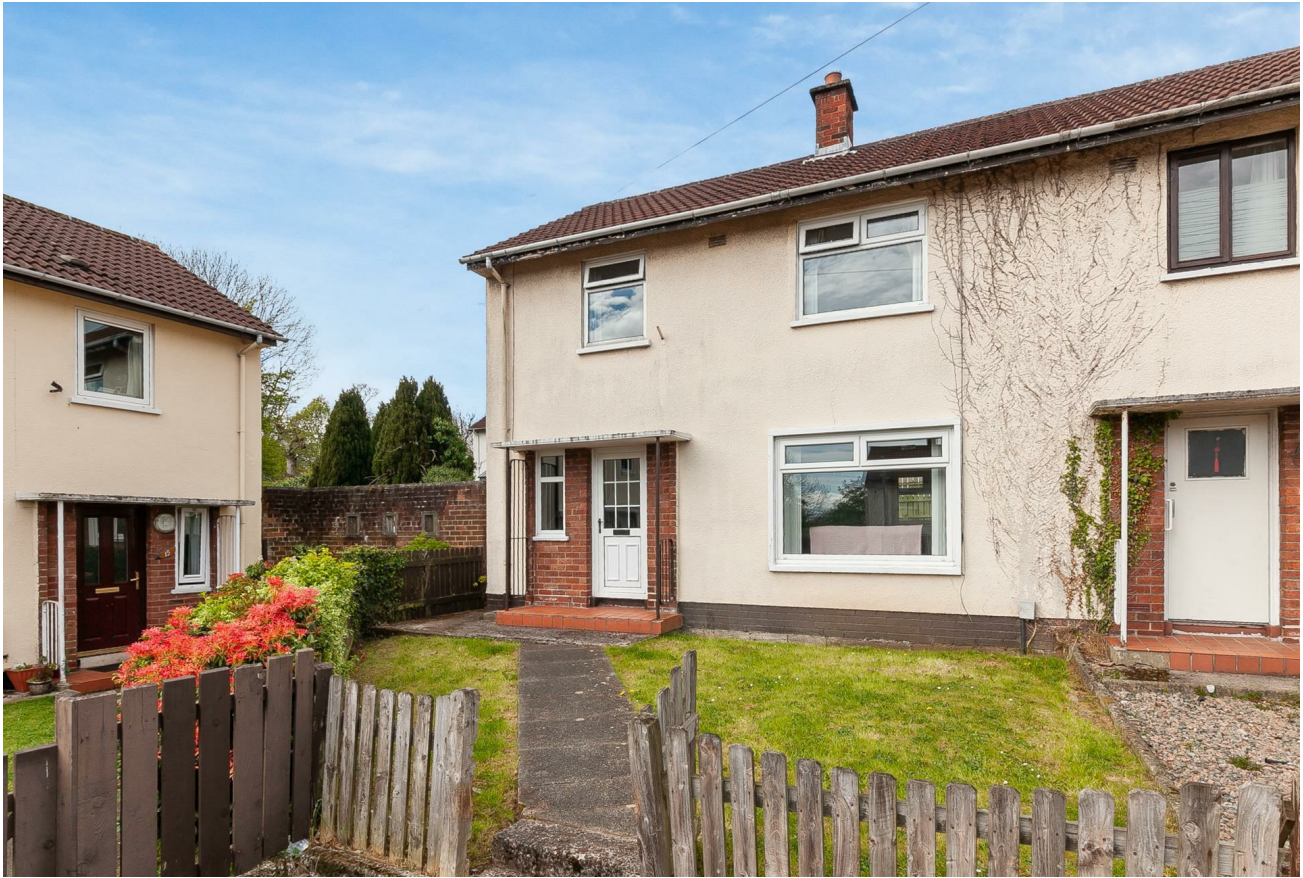
13 Waveney Grove, Belfast, BT15 4FW