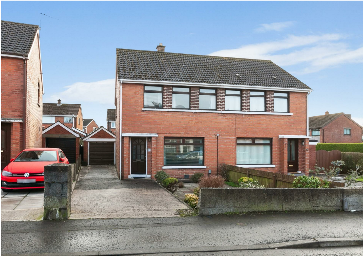
14 Carwood Park, Newtownabbey, BT36 5JU