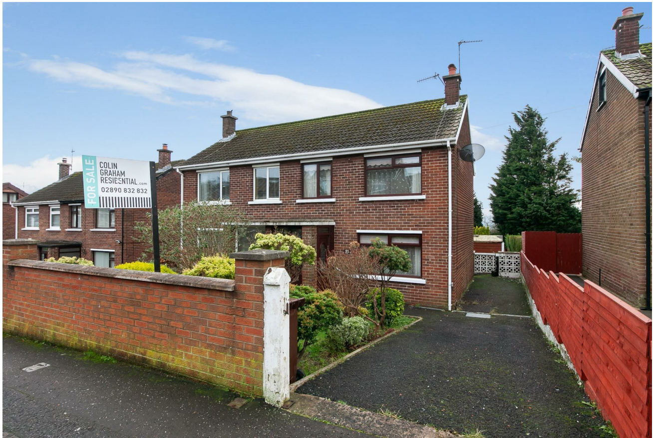
85 Church Crescent, Newtownabbey, BT36 6ET