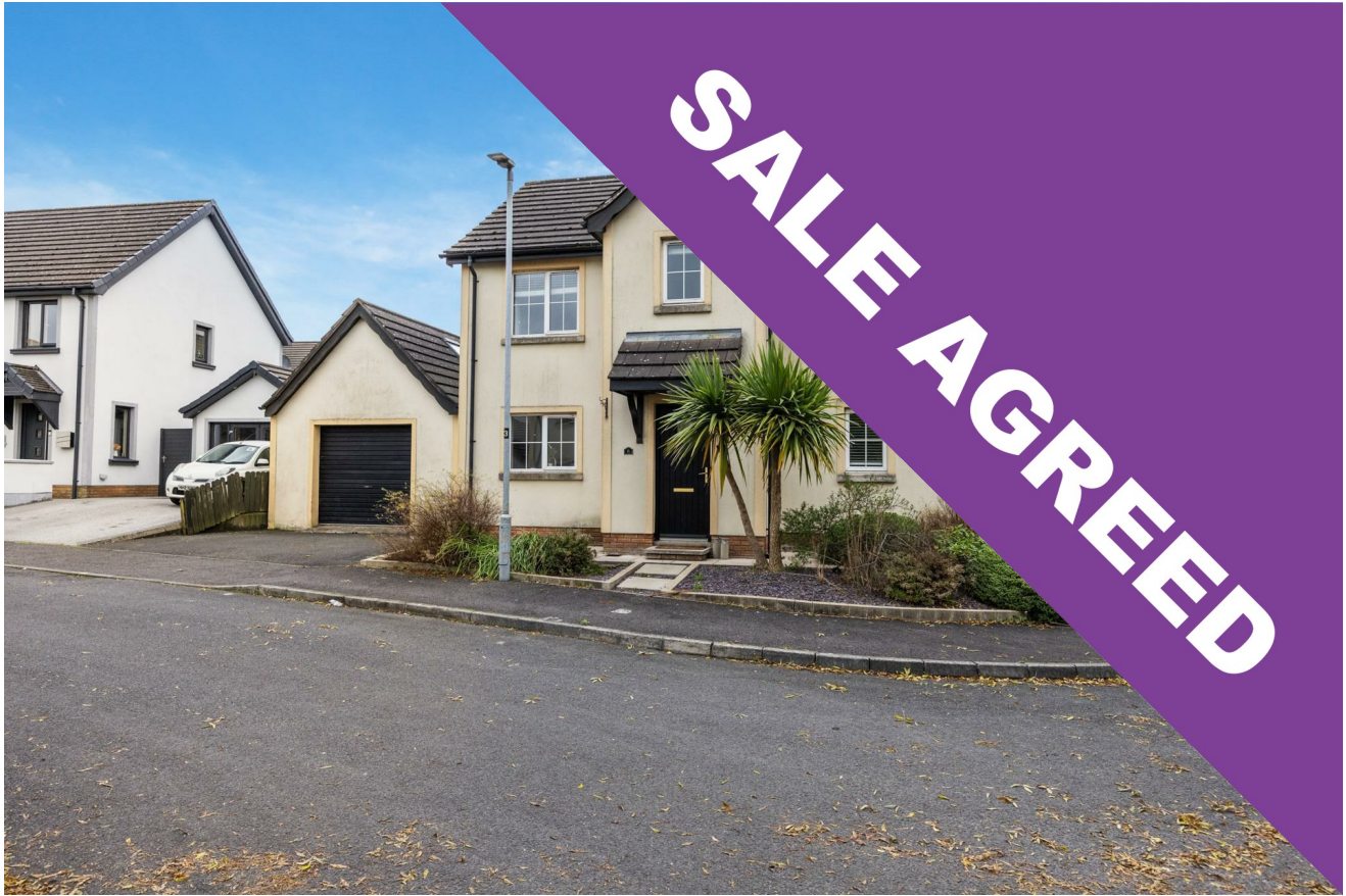
6 Castlebrook Way, Ballynure, BT39 9GY