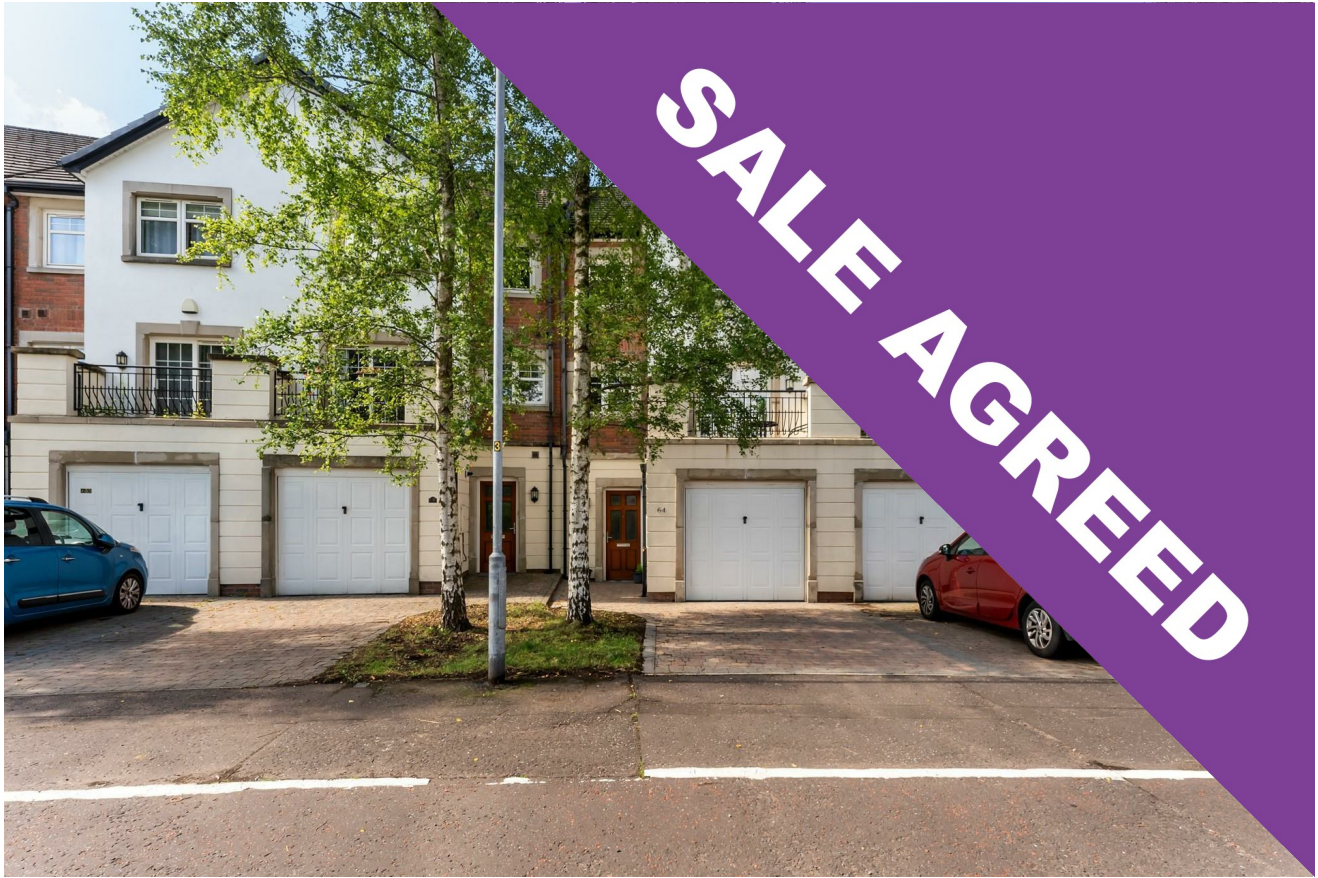
64 Beech Heights, Wellington Square, Belfast, BT7 3LQ