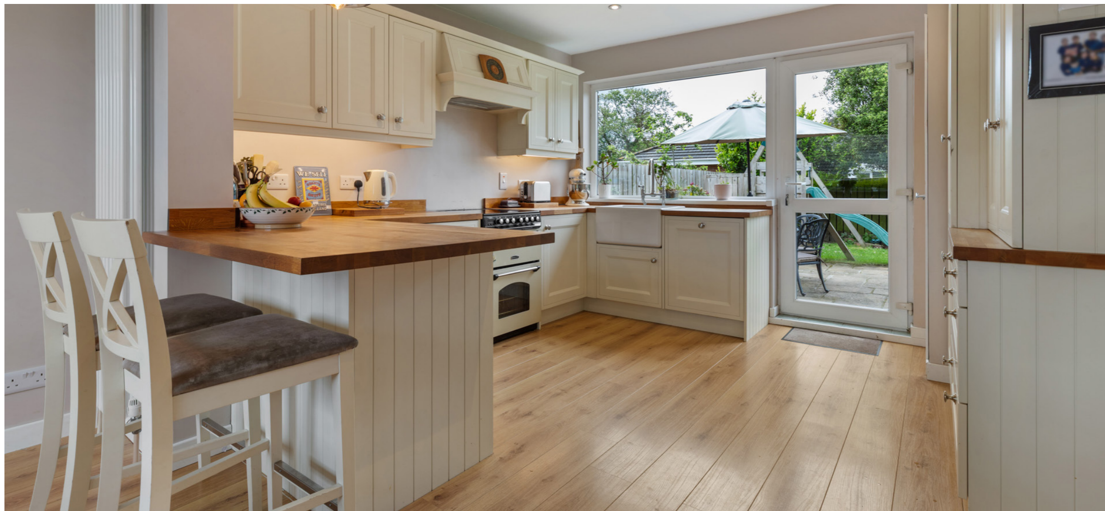
Kitchen open to dining