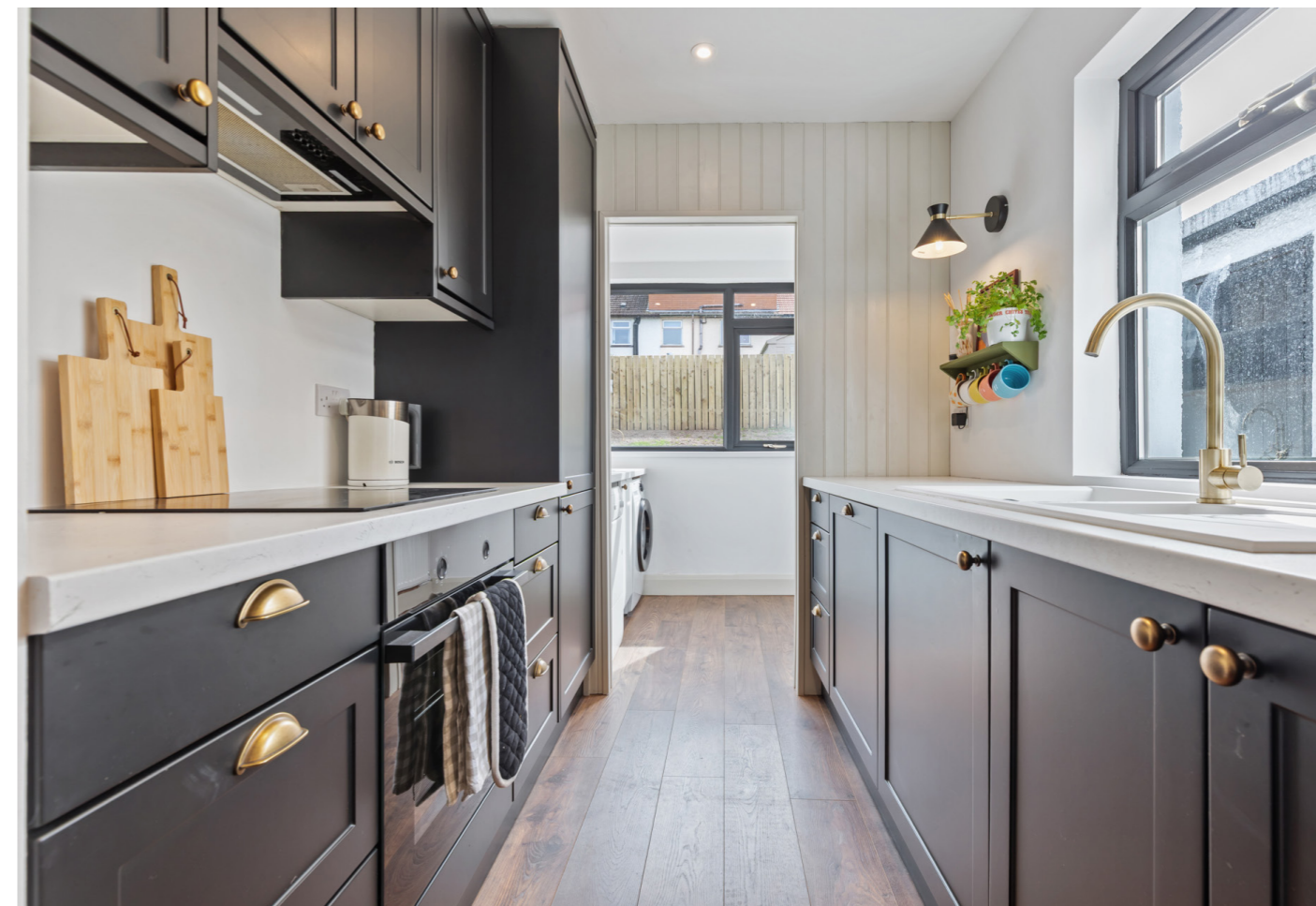
Lovely kitchen with appliances