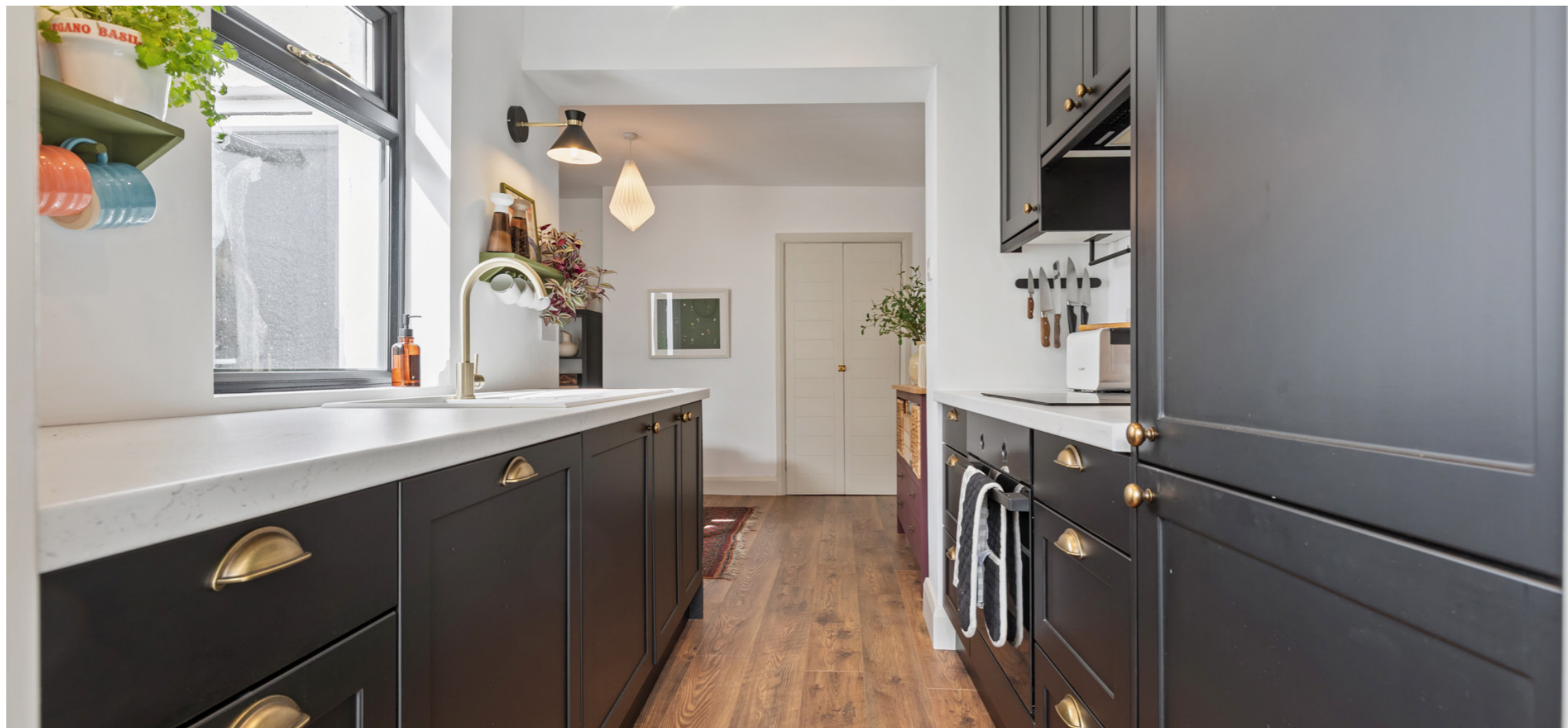
Luxury fitted and equipped kitchen open to dining area