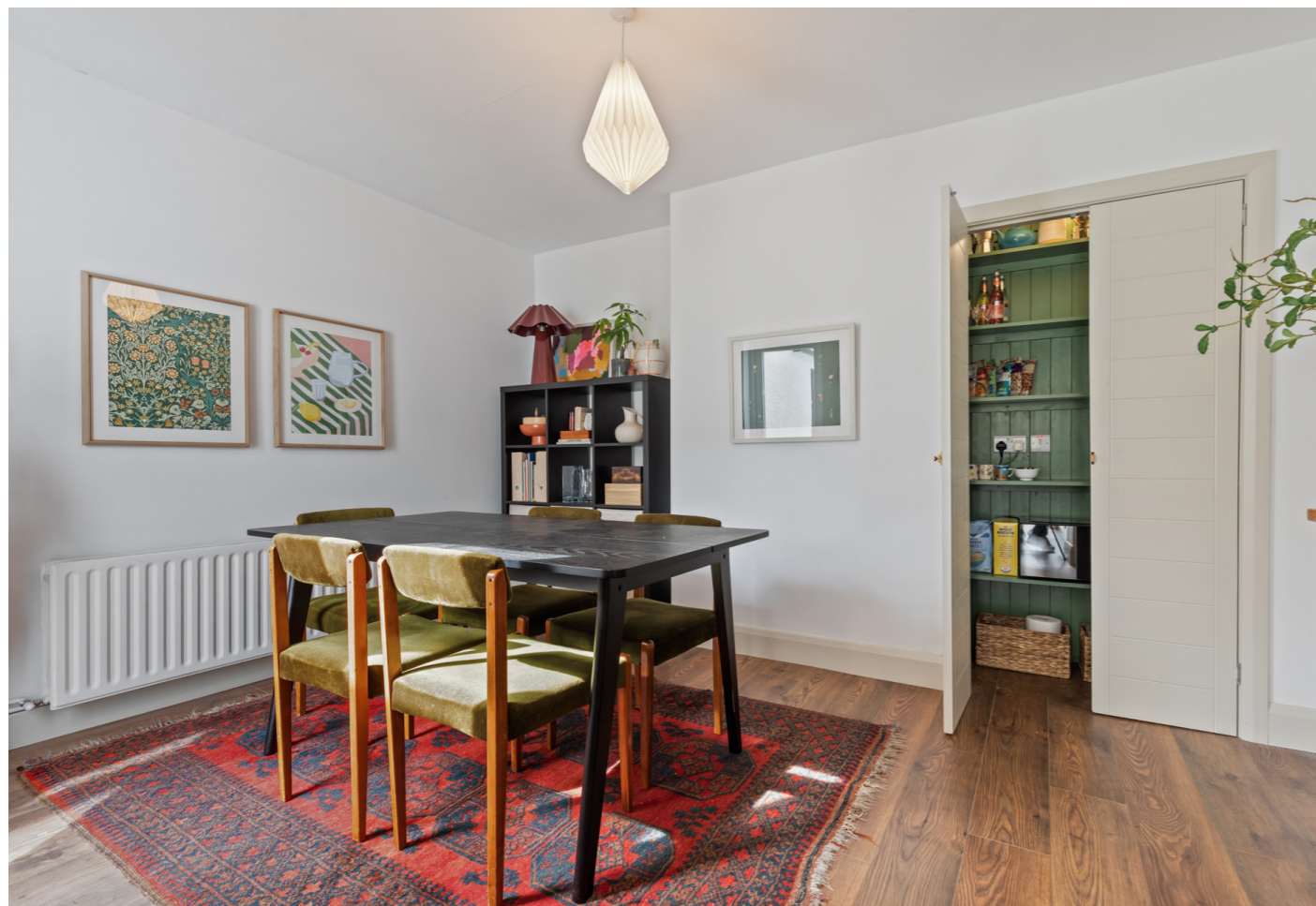
Dining room with shelved pantry storage