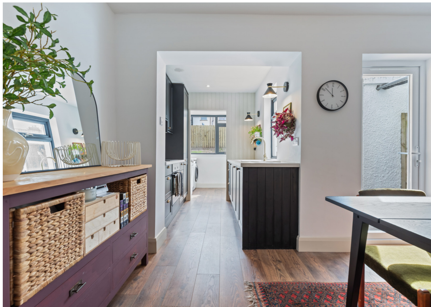
Dining open to kitchen