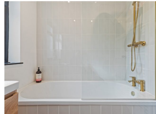
Luxury bathroom with bath and shower over