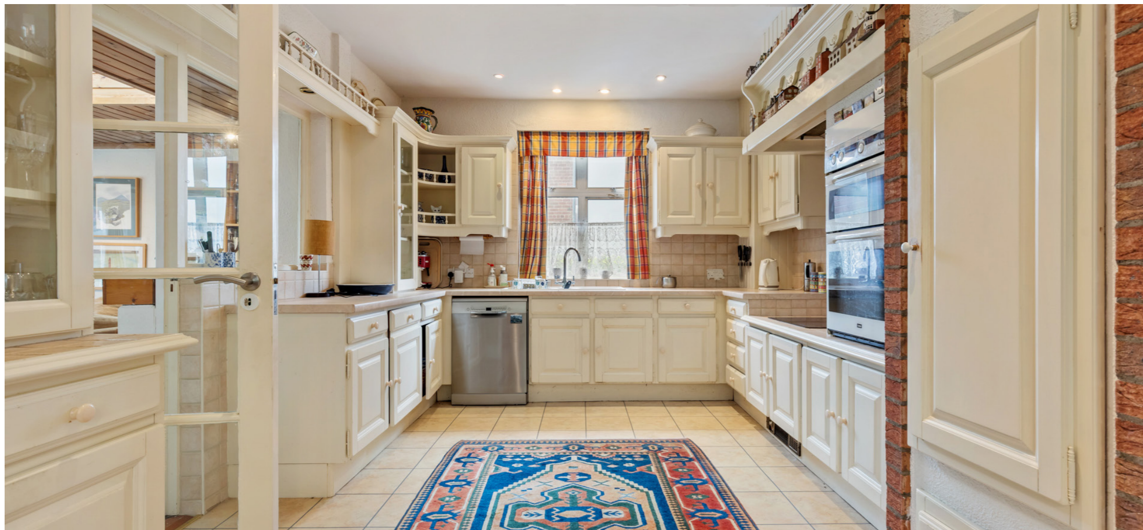
Kitchen open to casual dining