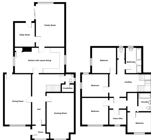
Total Area: 209.8 sq. m. - 2258 sq. ft. All measurements are approximate and for display purposes only.