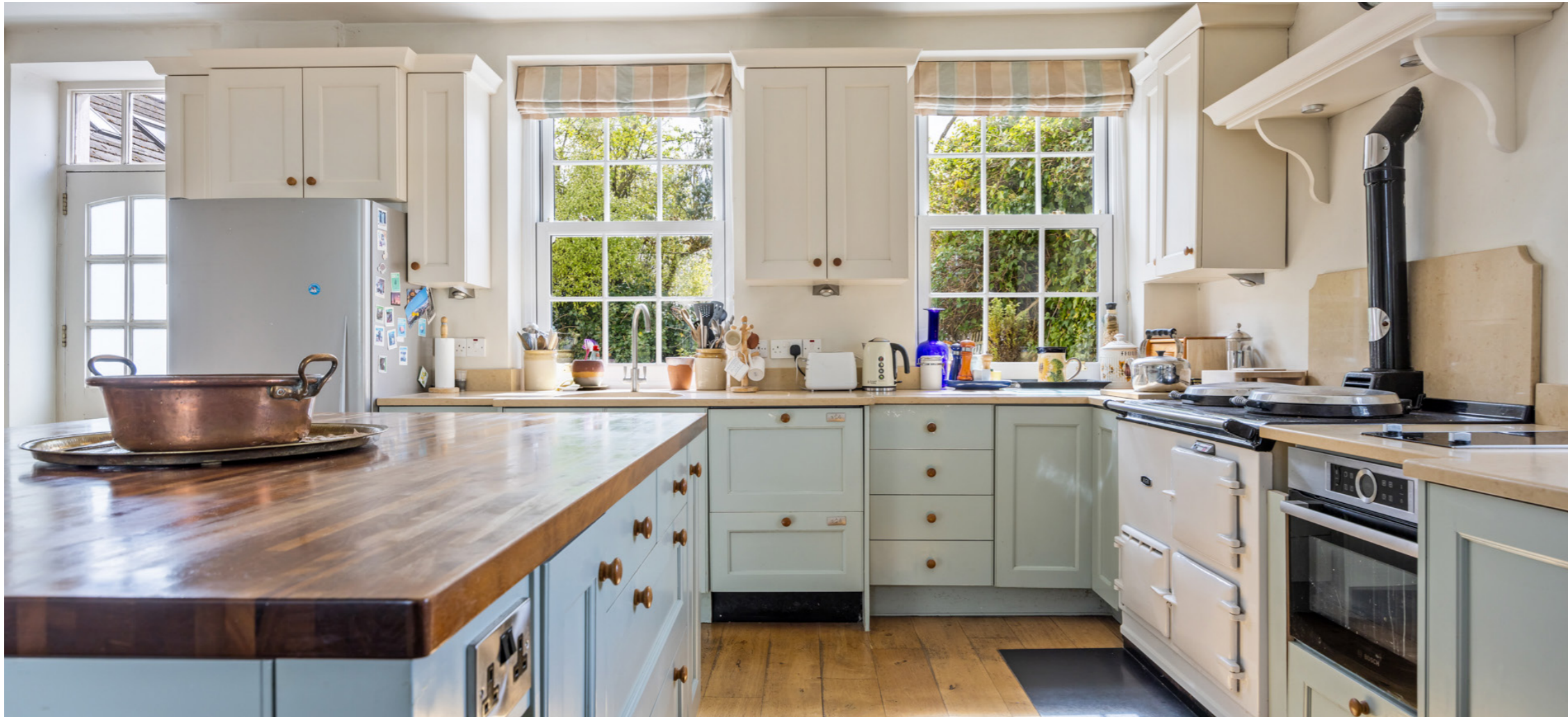
Handcrafted kitchen open to dining and sitting