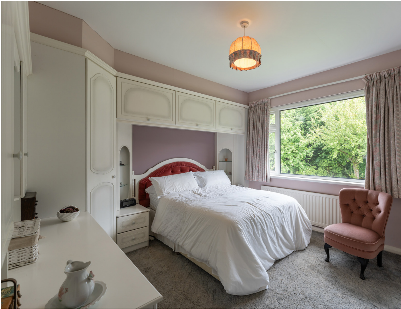
Bedroom (1) with built in furniture