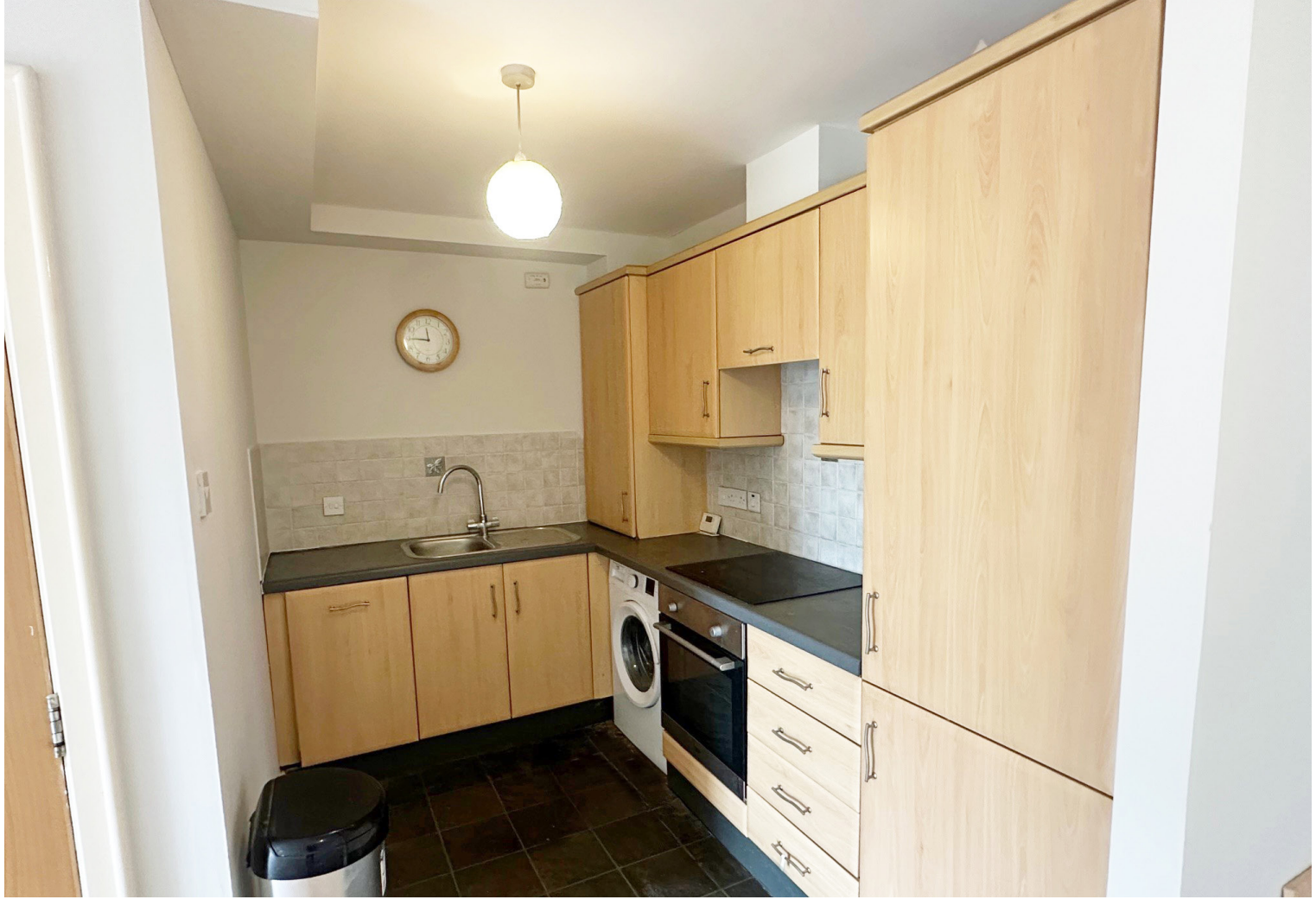
Kitchen with appliances