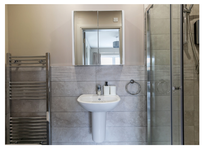
Ensuite shower room

Tarmac driveway with parking for two cars.