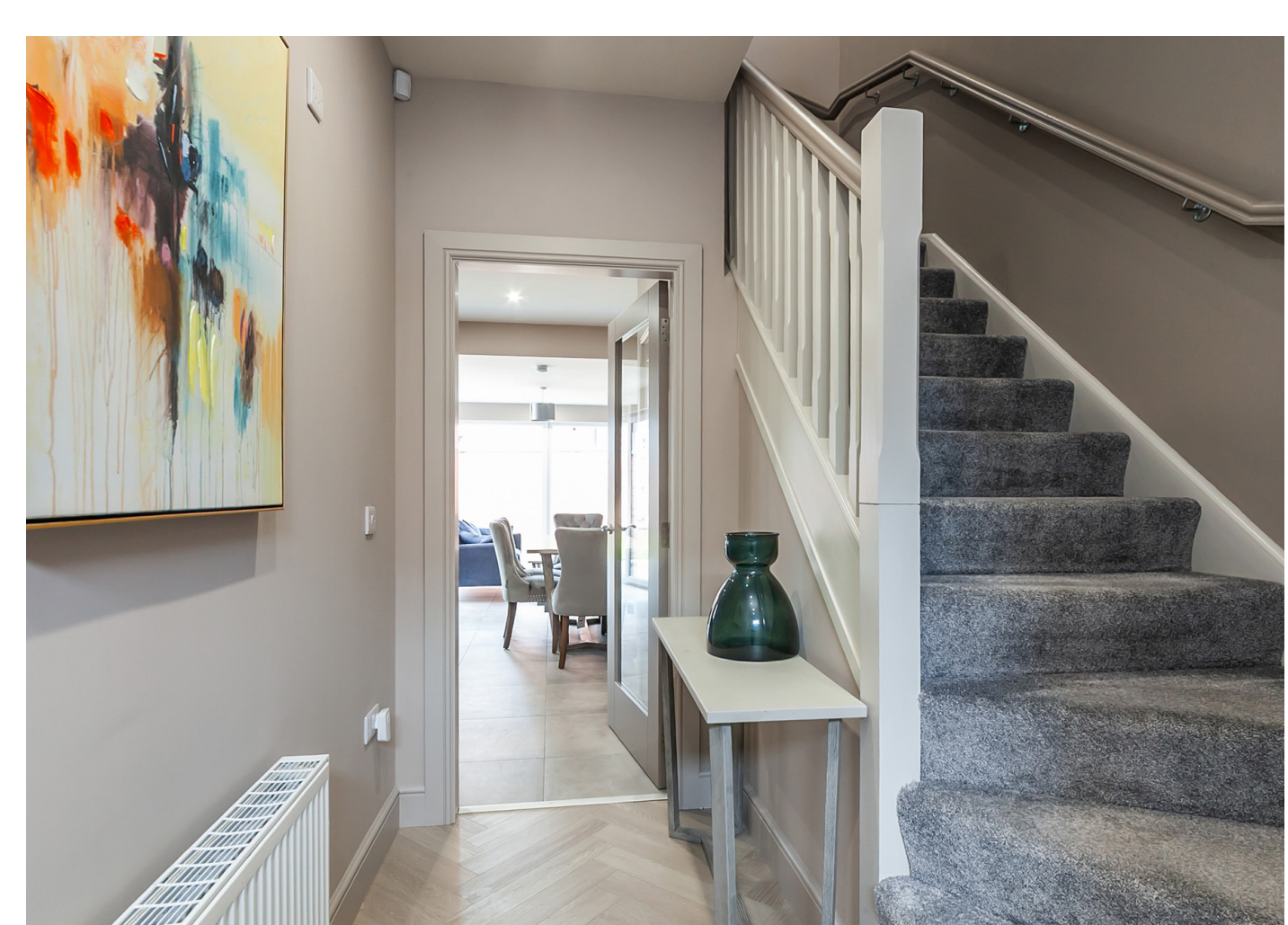
Experience | Experise | Results