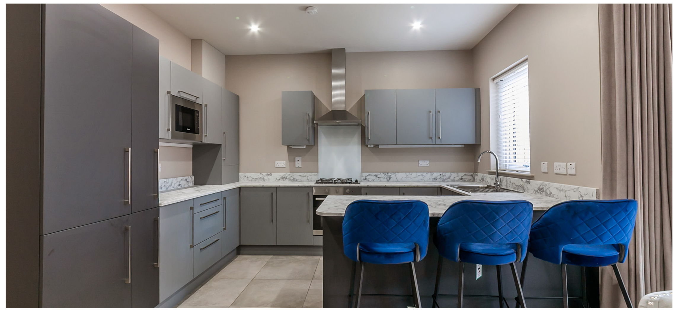
Luxury kitchen open to dining and sunroom