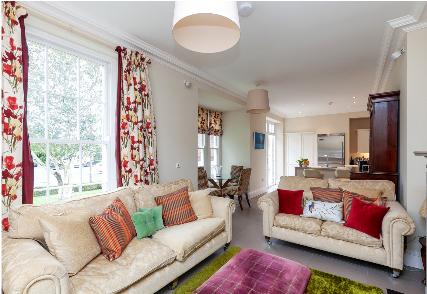
Drawing room open to luxury kitchen