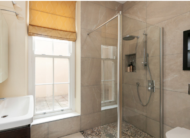
Luxury ensuite shower room

The apartment also comes with two private parking spaces.