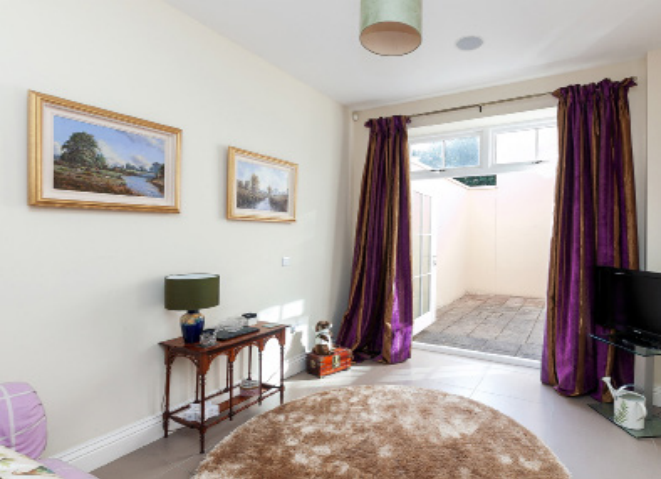
Living room/bedroom three