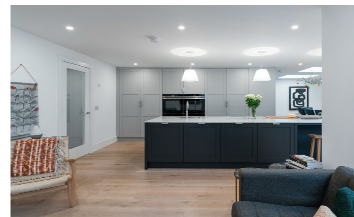
Living, dining kitchen