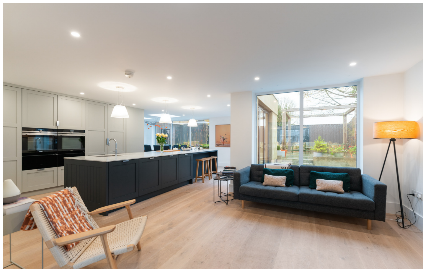
Lovely bright, open space