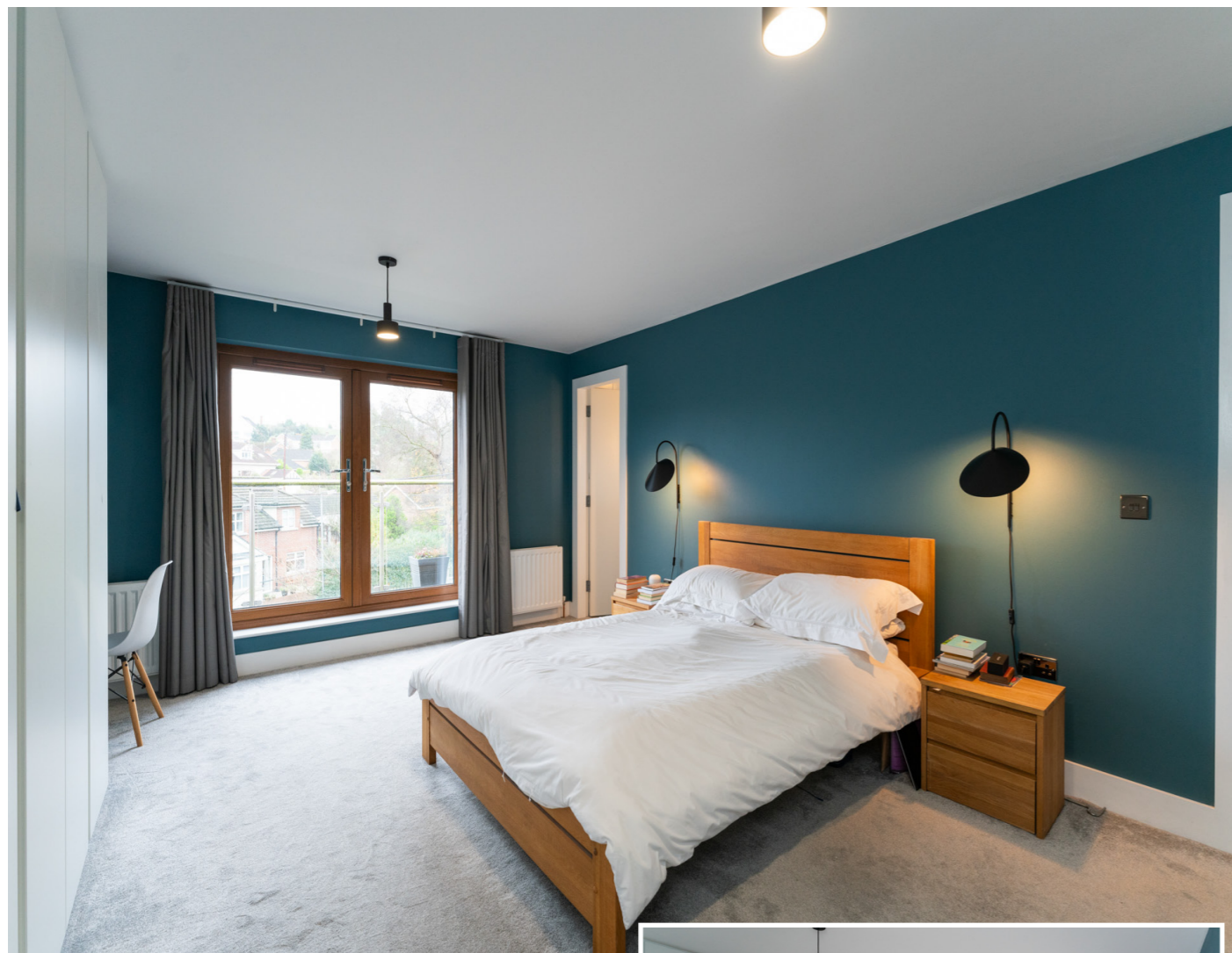
Bedroom one with balcony and extensive range of wardrobes