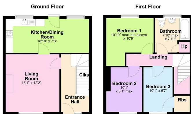
69 Meadowlands, Downpatrick

Terms & Conditions: Please note that these particulars do not constitute an offer or contract of sale. Any prospective purchaser should satisfy themselves by thorough inspection of the property and we recommend that any prospective purchaser should employ the professional services of a building surveyor and consider their findings prior to entering into contract. All such fees associated with this work will be the responsibility of the prospective purchaser regardless of whether the sale completes or not. In addition, none of the appliances or installations have been tested in any way whatsoever and it is our recommendation that a purchaser should fully satisfy themselves by employing an appropriate expert. We would also like to advise that our measurements are taken from the widest points of each room and should not be relied upon as completely accurate. You should not make decisions based on the measurements provided and double check measurements at all times. Valuation/Mortgage Service: As part of our service we would remind Vendors and potential purchasers that we have a Mortgage Broker available at this branch. If you are thinking of selling, we would be happy to carry out a free market appraisal of your property.