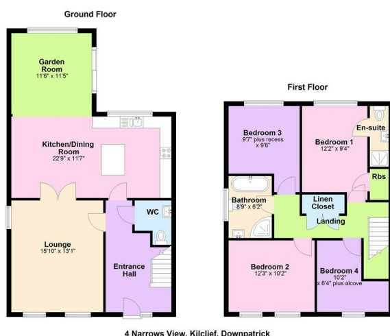
4 Narrows View, Kilclief, Downpatrick

Edel Curran: edel@quinnestateagents.com or 07703 612 257