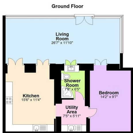
106B Saul Street, Downpatrick

Edel Curran: edel@quinnestateagents.com or 07703 612 257