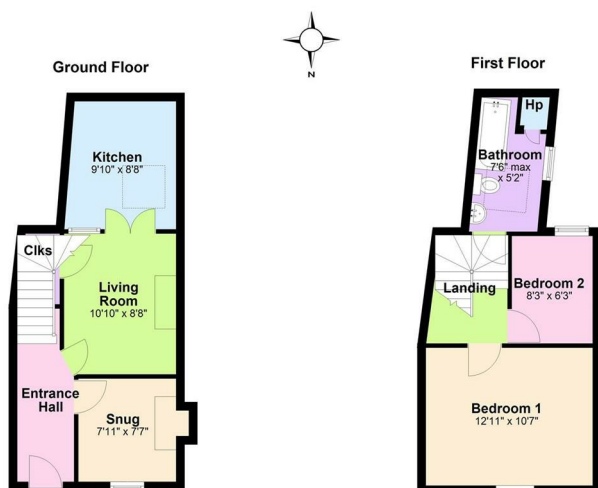
9 Church Hill, Killyleagh

Terms & Conditions: Please note that these particulars do not constitute an offer or contract of sale. Any prospective purchaser should satisfy themselves by thorough inspection of the property and we recommend that any prospective purchaser should employ the professional services of a building surveyor and consider their findings prior to entering into contract. All such fees associated with this work will be the responsibility of the prospective purchaser regardless of whether the sale completes or not. In addition, none of the appliances or installations have been tested in any way whatsoever and it is our recommendation that a purchaser should fully satisfy themselves by employing an appropriate expert. We would also like to advise that our measurements are taken from the widest points of each room and should not be relied upon as completely accurate. You should not make decisions based on the measurements provided and double check measurements at all times. Valuation/Mortgage Service: As part of our service we would remind Vendors and potential purchasers that we have a Mortgage Broker available at this branch. If you are thinking of selling, we would be happy to carry out a free market appraisal of your property.