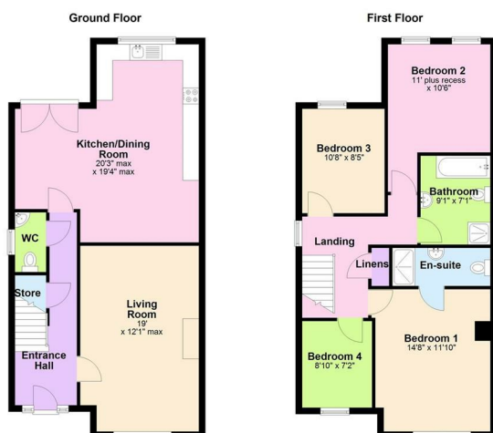
14 Race Course View, Downpatrick

Terms & Conditions: Please note that these particulars do not constitute an offer or contract of sale. Any prospective purchaser should satisfy themselves by thorough inspection of the property and we recommend that any prospective purchaser should employ the professional services of a building surveyor and consider their findings prior to entering into contract. All such fees associated with this work will be the responsibility of the prospective purchaser regardless of whether the sale completes or not. In addition, none of the appliances or installations have been tested in any way whatsoever and it is our recommendation that a purchaser should fully satisfy themselves by employing an appropriate expert. We would also like to advise that our measurements are taken from the widest points of each room and should not be relied upon as completely accurate. You should not make decisions based on the measurements provided and double check measurements at all times. Valuation/Mortgage Service: As part of our service we would remind Vendors and potential purchasers that we have a Mortgage Broker available at this branch. If you are thinking of selling, we would be happy to carry out a free market appraisal of your property.