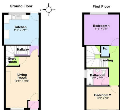
42 Stream Street, Downpatrick

Terms & Conditions: Please note that these particulars do not constitute an offer or contract of sale. Any prospective purchaser should satisfy themselves by thorough inspection of the property and we recommend that any prospective purchaser should employ the professional services of a building surveyor and consider their findings prior to entering into contract. All such fees associated with this work will be the responsibility of the prospective purchaser regardless of whether the sale completes or not. In addition, none of the appliances or installations have been tested in any way whatsoever and it is our recommendation that a purchaser should fully satisfy themselves by employing an appropriate expert. We would also like to advise that our measurements are taken from the widest points of each room and should not be relied upon as completely accurate. You should not make decisions based on the measurements provided and double check measurements at all times. Valuation/Mortgage Service: As part of our service we would remind Vendors and potential purchasers that we have a Mortgage Broker available at this branch. If you are thinking of selling, we would be happy to carry out a free market appraisal of your property.