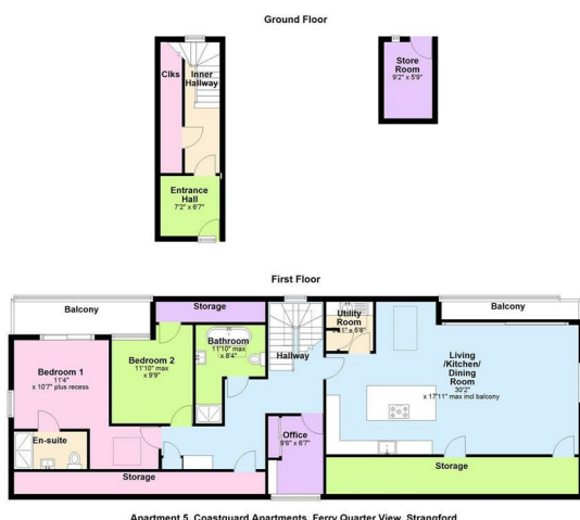
Apartment 5, Coastguard Apartments, Ferry Quarter View, Strangford

Terms & Conditions: Please note that these particulars do not constitute an offer or contract of sale. Any prospective purchaser should satisfy themselves by thorough inspection of the property and we recommend that any prospective purchaser should employ the professional services of a building surveyor and consider their findings prior to entering into contract. All such fees associated with this work will be the responsibility of the prospective purchaser regardless of whether the sale completes or not. In addition, none of the appliances or installations have been tested in any way whatsoever and it is our recommendation that a purchaser should fully satisfy themselves by employing an appropriate expert. We would also like to advise that our measurements are taken from the widest points of each room and should not be relied upon as completely accurate. You should not make decisions based on the measurements provided and double check measurements at all times. Valuation/Mortgage Service: As part of our service we would remind Vendors and potential purchasers that we have a Mortgage Broker available at this branch. If you are thinking of selling, we would be happy to carry out a free market appraisal of your property.