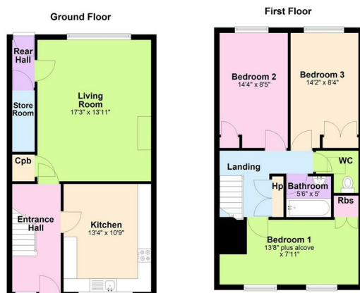
133 Saul Street, Downpatrick

Terms & Conditions: Please note that these particulars do not constitute an offer or contract of sale. Any prospective purchaser should satisfy themselves by thorough inspection of the property and we recommend that any prospective purchaser should employ the professional services of a building surveyor and consider their findings prior to entering into contract. All such fees associated with this work will be the responsibility of the prospective purchaser regardless of whether the sale completes or not. In addition, none of the appliances or installations have been tested in any way whatsoever and it is our recommendation that a purchaser should fully satisfy themselves by employing an appropriate expert. We would also like to advise that our measurements are taken from the widest points of each room and should not be relied upon as completely accurate. You should not make decisions based on the measurements provided and double check measurements at all times. Valuation/Mortgage Service: As part of our service we would remind Vendors and potential purchasers that we have a Mortgage Broker available at this branch. If you are thinking of selling, we would be happy to carry out a free market appraisal of your property.