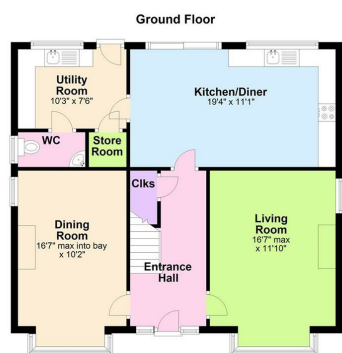
15 The Anchorage, Killyleagh, Downpatrick