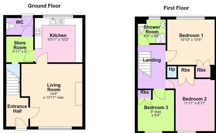
14 Reilly Park, Banbridge

Terms & Conditions: Please note that these particulars do not constitute an offer or contract of sale. Any prospective purchaser should satisfy themselves by thorough inspection of the property and we recommend that any prospective purchaser should employ the professional services of a building surveyor and consider their findings prior to entering into contract. All such fees associated with this work will be the responsibility of the prospective purchaser regardless of whether the sale completes or not. In addition, none of the appliances or installations have been tested in any way whatsoever and it is our recommendation that a purchaser should fully satisfy themselves by employing an appropriate expert. We would also like to advise that our measurements are taken from the widest points of each room and should not be relied upon as completely accurate. You should not make decisions based on the measurements provided and double check measurements at all times. Valuation/Mortgage Service: As part of our service we would remind Vendors and potential purchasers that we have a Mortgage Broker available at this branch. If you are thinking of selling, we would be happy to carry out a free market appraisal of your property.