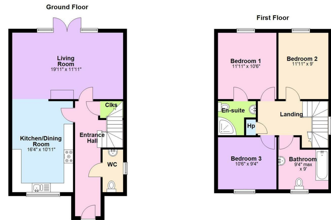
11 Iveagh Court, Blackskull, Dromore

If you require a viewing please get in contact via phone Leanne on 02840622226/07703612260 or email - banbridge@quinnestateagents.com