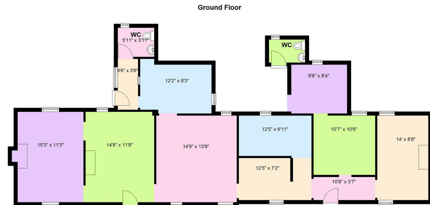
47-49 Castlewella Road, Rathfriland

If you require a viewing please get in contact via phone Leanne on 02840622226/07703612260 or email - banbridge@quinnestateagents.com