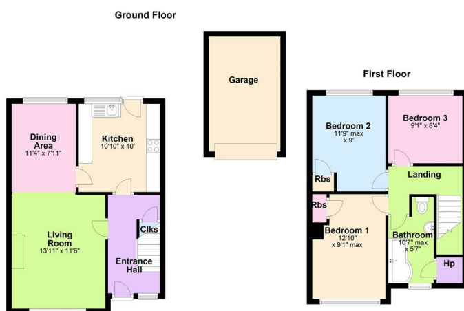
2 Knowes Crescent, Ballynahinch

Terms & Conditions: Please note that these particulars do not constitute an offer or contract of sale. Any prospective purchaser should satisfy themselves by thorough inspection of the property and we recommend that any prospective purchaser should employ the professional services of a building surveyor and consider their findings prior to entering into contract. All such fees associated with this work will be the responsibility of the prospective purchaser regardless of whether the sale completes or not. In addition, none of the appliances or installations have been tested in any way whatsoever and it is our recommendation that a purchaser should fully satisfy themselves by employing an appropriate expert. We would also like to advise that our measurements are taken from the widest points of each room and should not be relied upon as completely accurate. You should not make decisions based on the measurements provided and double check measurements at all times. Valuation/Mortgage Service: As part of our service we would remind Vendors and potential purchasers that we have a Mortgage Broker available at this branch. If you are thinking of selling, we would be happy to carry out a free market appraisal of your property.