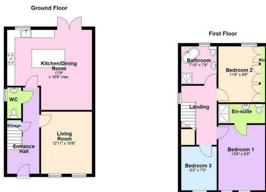
88 Cedar Hill, Ballynahinch

To book a viewing please contact Carrie on 02897564400/07803626095 or email - ballynahinch@quinnestateagents.com