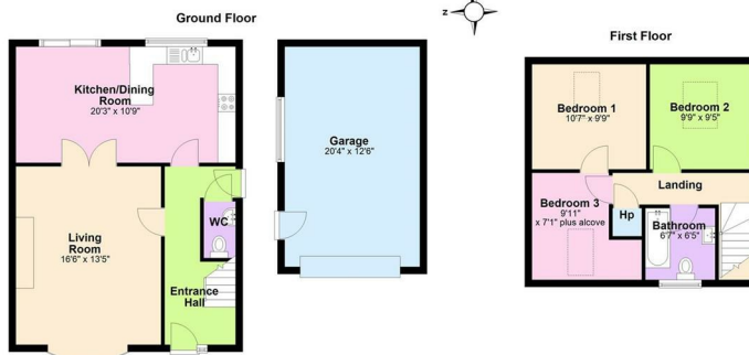
19 Ashburn, Ballynahinch

Terms & Conditions: Please note that these particulars do not constitute an offer or contract of sale. Any prospective purchaser should satisfy themselves by thorough inspection of the property and we recommend that any prospective purchaser should employ the professional services of a building surveyor and consider their findings prior to entering into contract. All such fees associated with this work will be the responsibility of the prospective purchaser regardless of whether the sale completes or not. In addition, none of the appliances or installations have been tested in any way whatsoever and it is our recommendation that a purchaser should fully satisfy themselves by employing an appropriate expert. We would also like to advise that our measurements are taken from the widest points of each room and should not be relied upon as completely accurate. You should not make decisions based on the measurements provided and double check measurements at all times. Valuation/Mortgage Service: As part of our service we would remind Vendors and potential purchasers that we have a Mortgage Broker available at this branch. If you are thinking of selling, we would be happy to carry out a free market appraisal of your property.