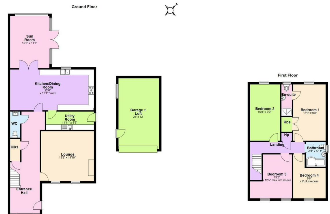
5 Cherry Burn, Lisburn

It is finished to an exceptional standard throughout. From its thoughtfully planned layout to its high quality features including high ceilings and large windows which flood the property with light, to a Nest dual-zoned heating system and integrated Beam vacuum system.