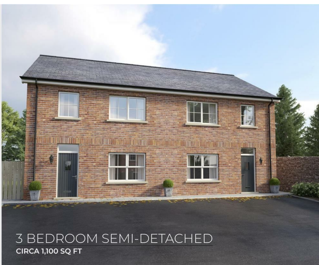
3 BEDROOM SEMI-DETACHED CIRCA 1,100 SQ FT