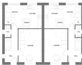
SITE 5 - HOUSE TYPE 1 / 1100sqft GROUND FLOOR PLAN