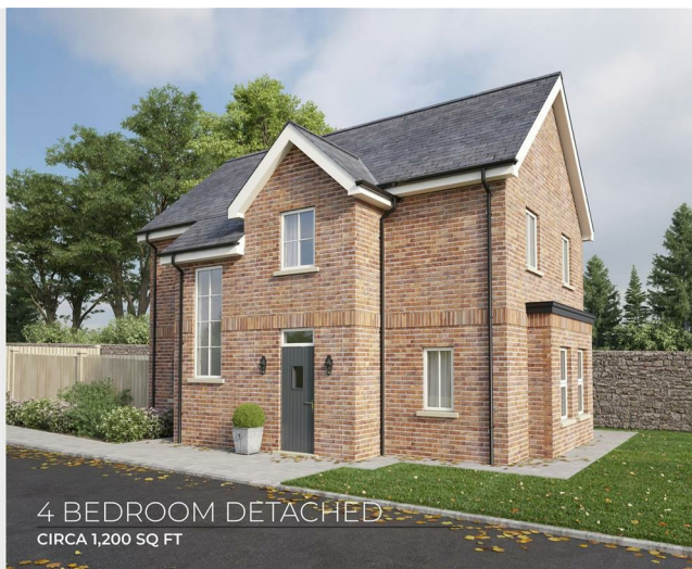
4 BEDROOM DETACHED CIRCA 1,200 SQ FT