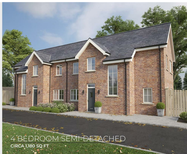
4 BEDROOM SEMI-DETACHED CIRCA 1,180 SQ FT