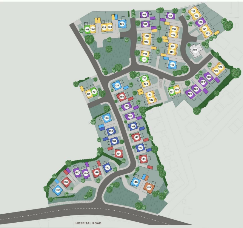
The Panacea (HTA) 4 Bedroom Detached Plots: 145