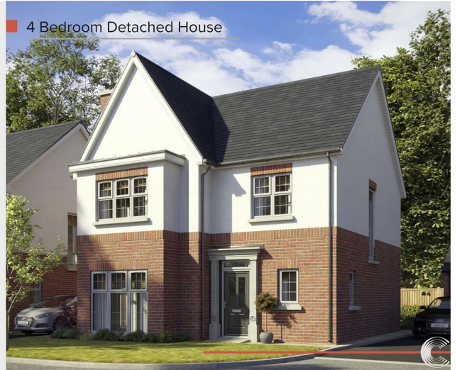
The Nightingale (House Type C)

These particulars, whilst believed to be accurate are set out as a general outline only for guidance and do not constitute any part of an offer or contract. Intending purchasers should not rely on them as statements of representation of fact, but must satisfy themselves by inspection or otherwise as to their accuracy. No person in this firm's employment has the authority to make or give any representation or warranty in respect of the property.