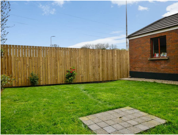
Enclosed rear garden laid in lawn bordered by timber fencing.