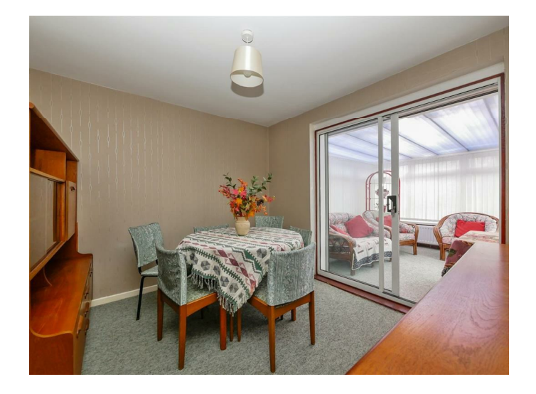
Sliding door access to the conservatory.