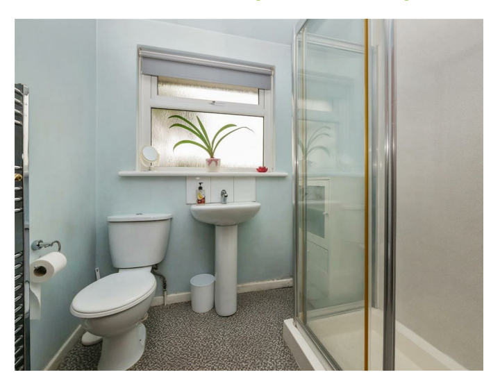
Comprising corner shower cubicle with Triton T80 shower, low flush w/c, pedestal wash hand basin, chrome towel radiator.