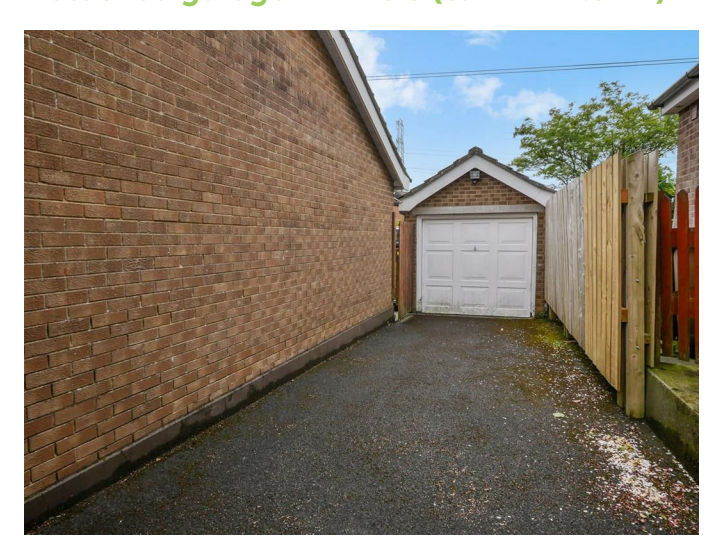
Up and over door, housing oil fired boiler, light and power.