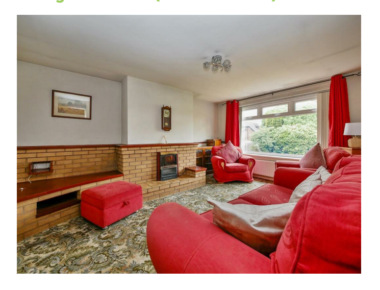
Brick fireplace with raised tiled hearth.