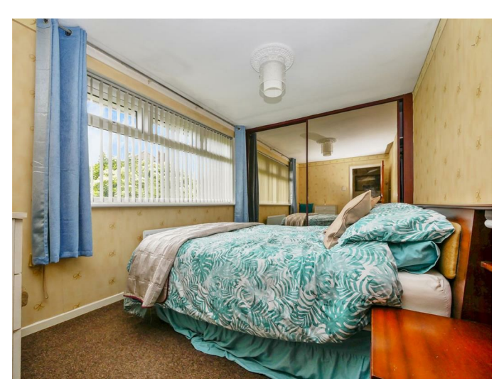
Wall to wall sliding robes.