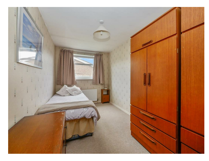
Bedroom 2 13'3 x 7'11 (4.04m x 2.41m)