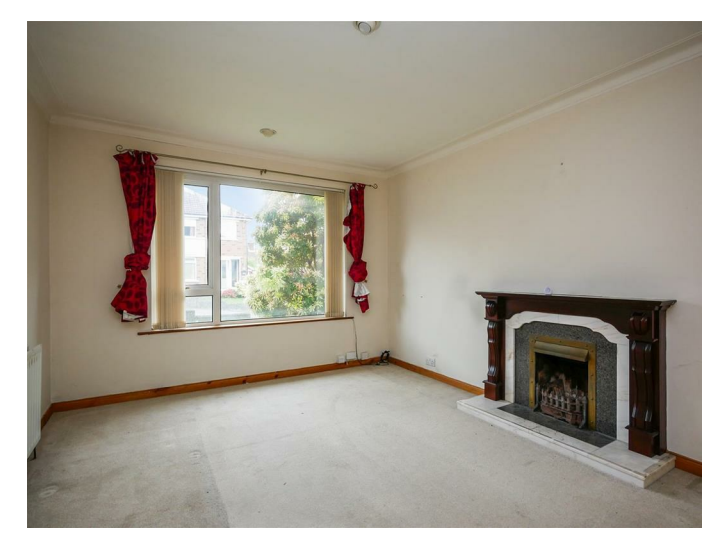
(at widest points) Through lounge / dining room with fireplace and raised dining area.