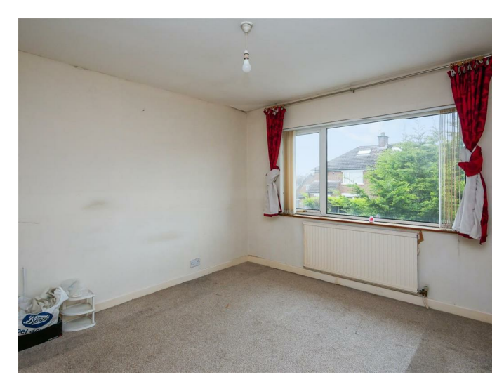
Bedroom 2 11'2" x 10'6" (3.41m x 3.21m)