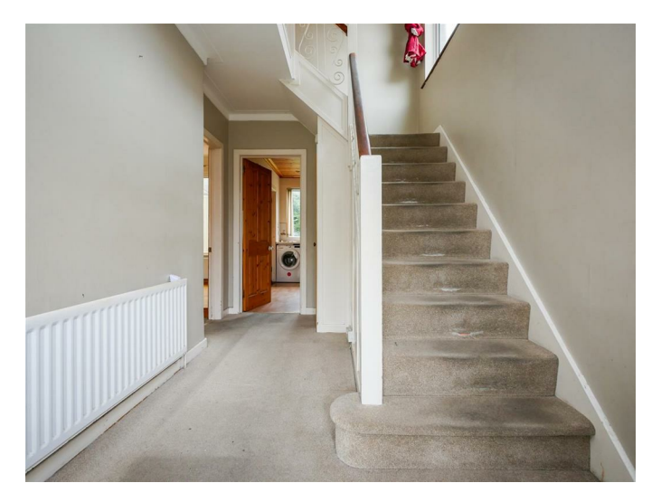
Double glazed hardwood front door and surround opens onto spacious entrance hall.