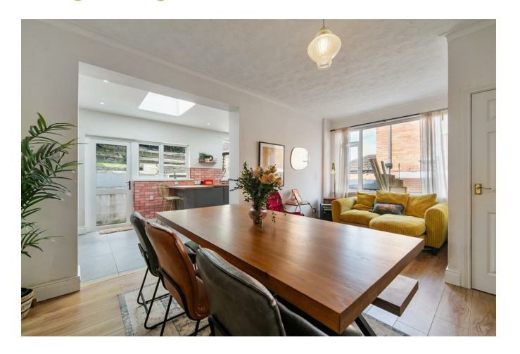
Decorative fireplace with wooden surround. Laminate flooring. Open to extended kitchen.