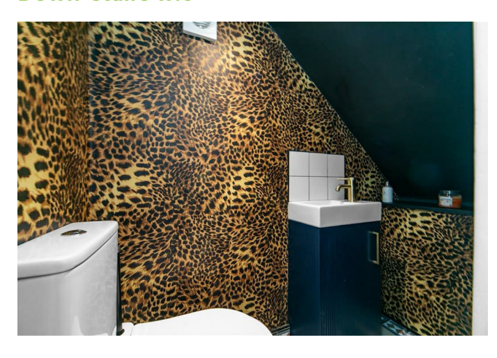
Sink unit with storage below. Low flush w.c