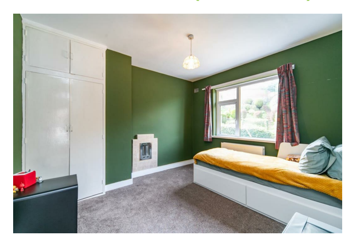
Tiled fire place. Built in robes. Access to the roof space.