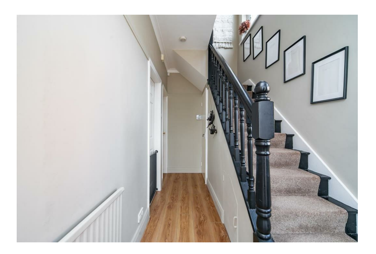
Glass panelled front door with glazed side panels to entrance hall. Laminate flooring.