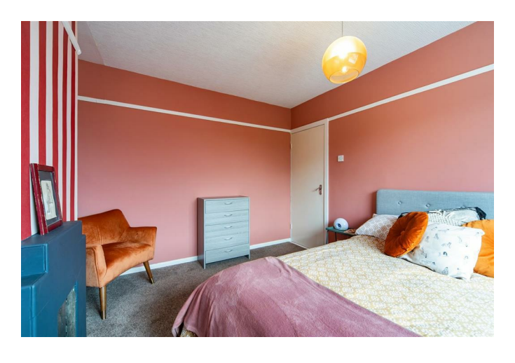
Bedroom Two 11'5 x 10'7 (3.48m x 3.23m)