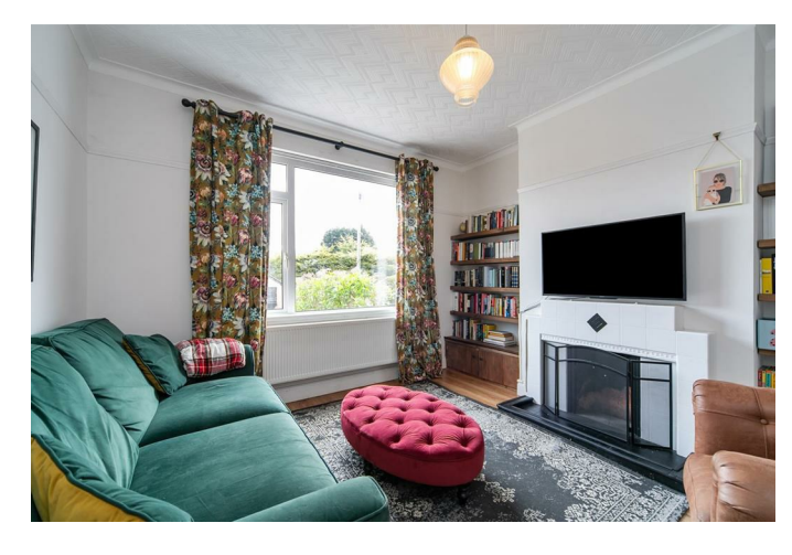
Tied fireplace with tiled hearth housing an open fire.