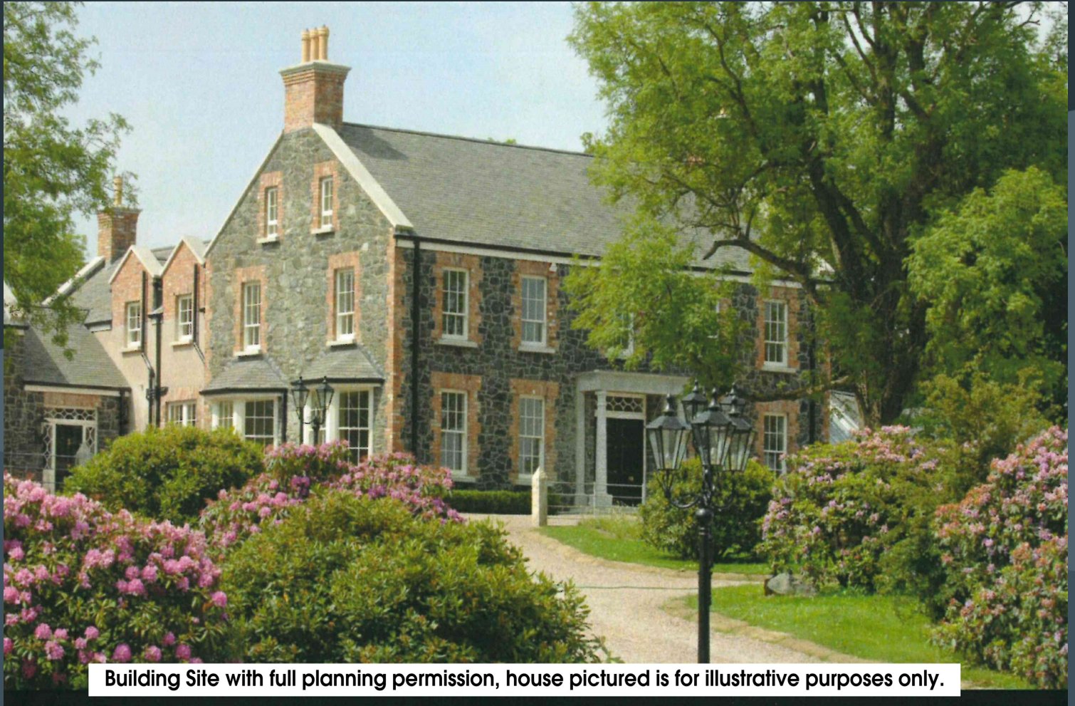
Building Site with full planning permission, house pictured is for illustrative purposes only.

Building site and lands @ VILLAWOOD MEADOWS Dromore BT25 1NH