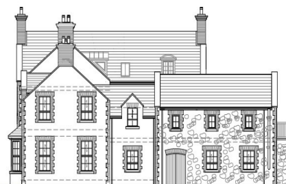
REAR (SOUTHEAST) ELEVATION