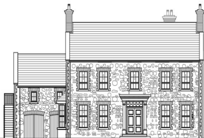
FRONT (NORTHWEST) ELEVATION