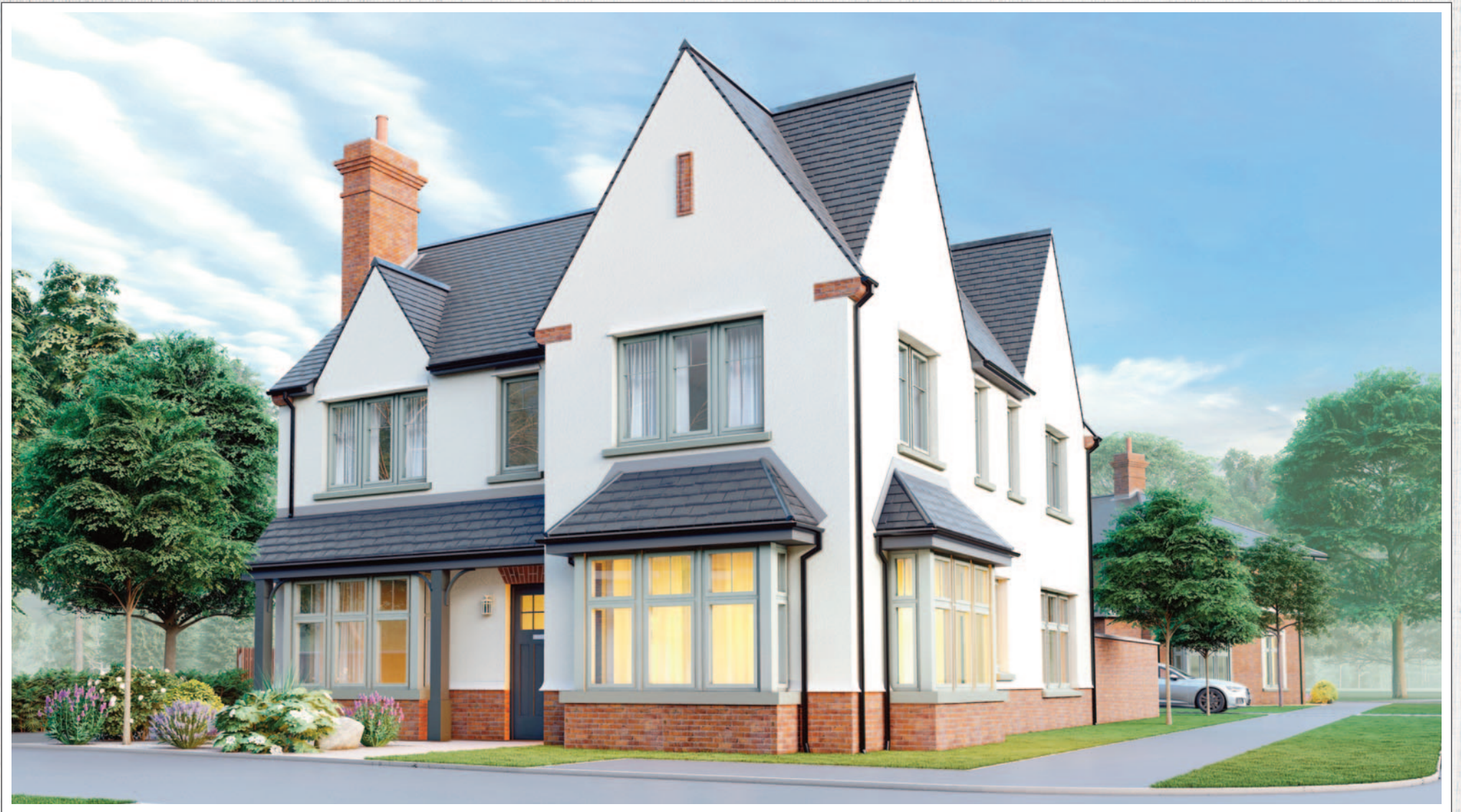
ABOVE: COMPUTER VISUAL OF SITE 4C