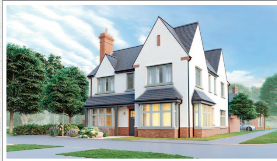
ABOVE: COMPUTER VISUAL OF SITE 4