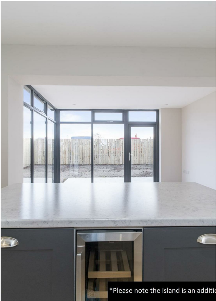
*Please note the island is an additional extra in the Birch house type