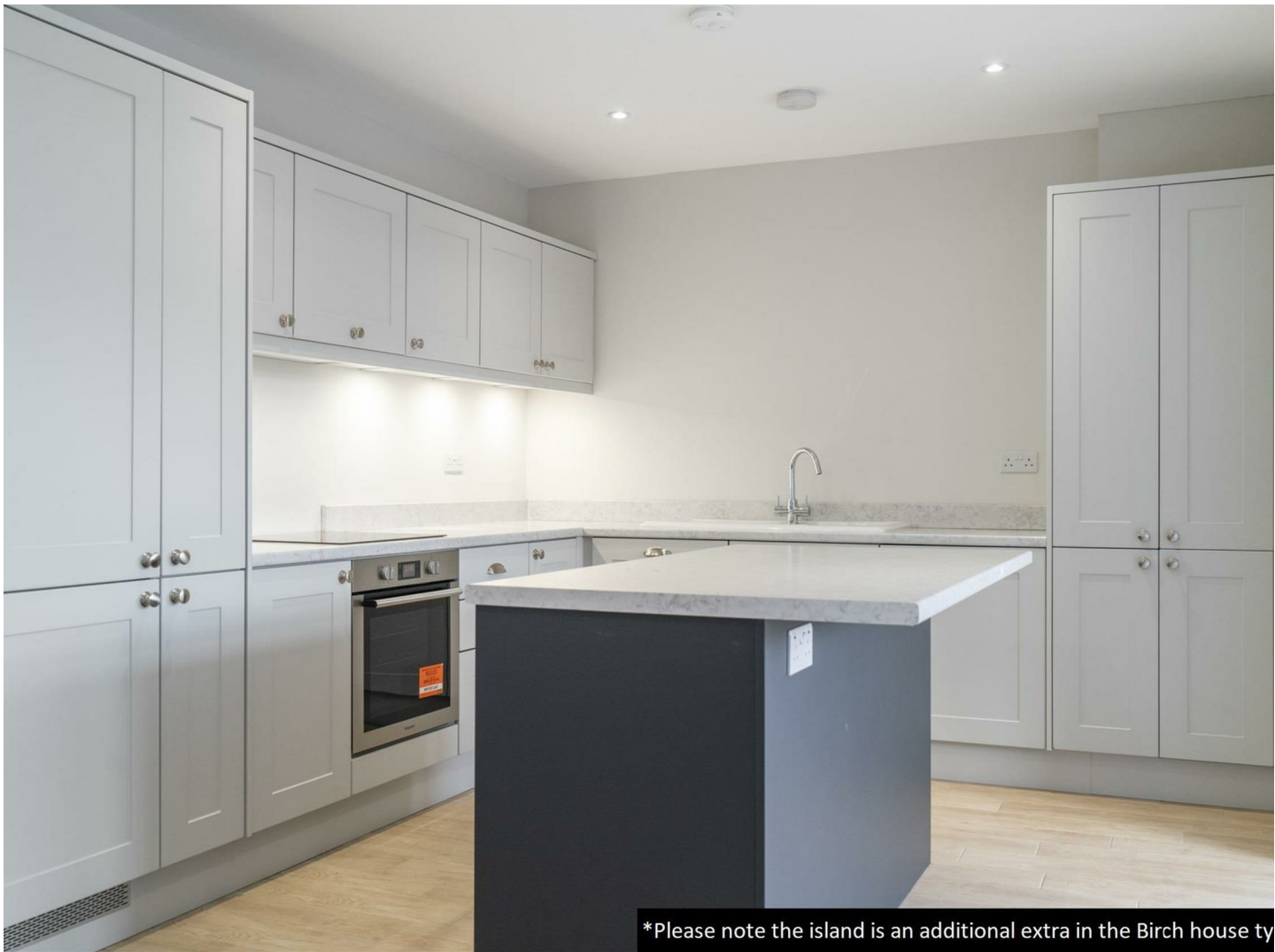
*Please note the island is an additional extra in the Birch house type