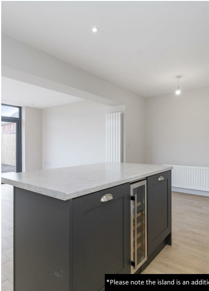
*Please note the island is an additional extra in the Birch house type