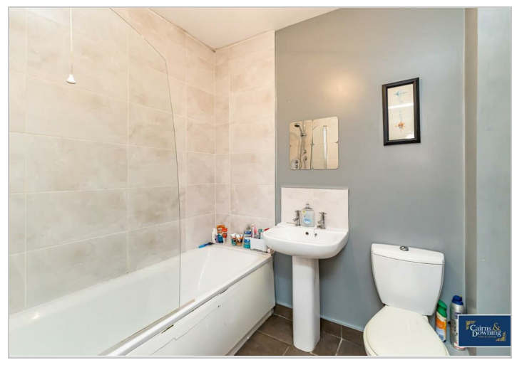
These particulars, whilst believed to be accurate are set out as a general outline only for guidance and do not constitute any part of an offer or contract. Intending purchasers should not rely on them as statements of representation of fact, but must satisfy themselves by inspection or otherwise as to their accuracy. No person in this firms employment has the authority to make or give any representation or warranty in respect of the property.