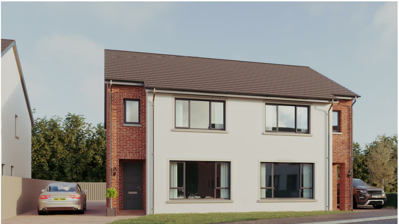
HOUSE TYPE 1

Offering easy access to National Trust sites, nature reserves, and leisurely strolls, living here makes every day feel like an adventure. Whether you're drawn to the tranquility of Barr's Bay for a refreshing swim or the vibrant ambience of Greyabbey Village for eclectic shopping and dining, you can embrace a lifestyle where every moment is framed by natural beauty and endless possibilities.