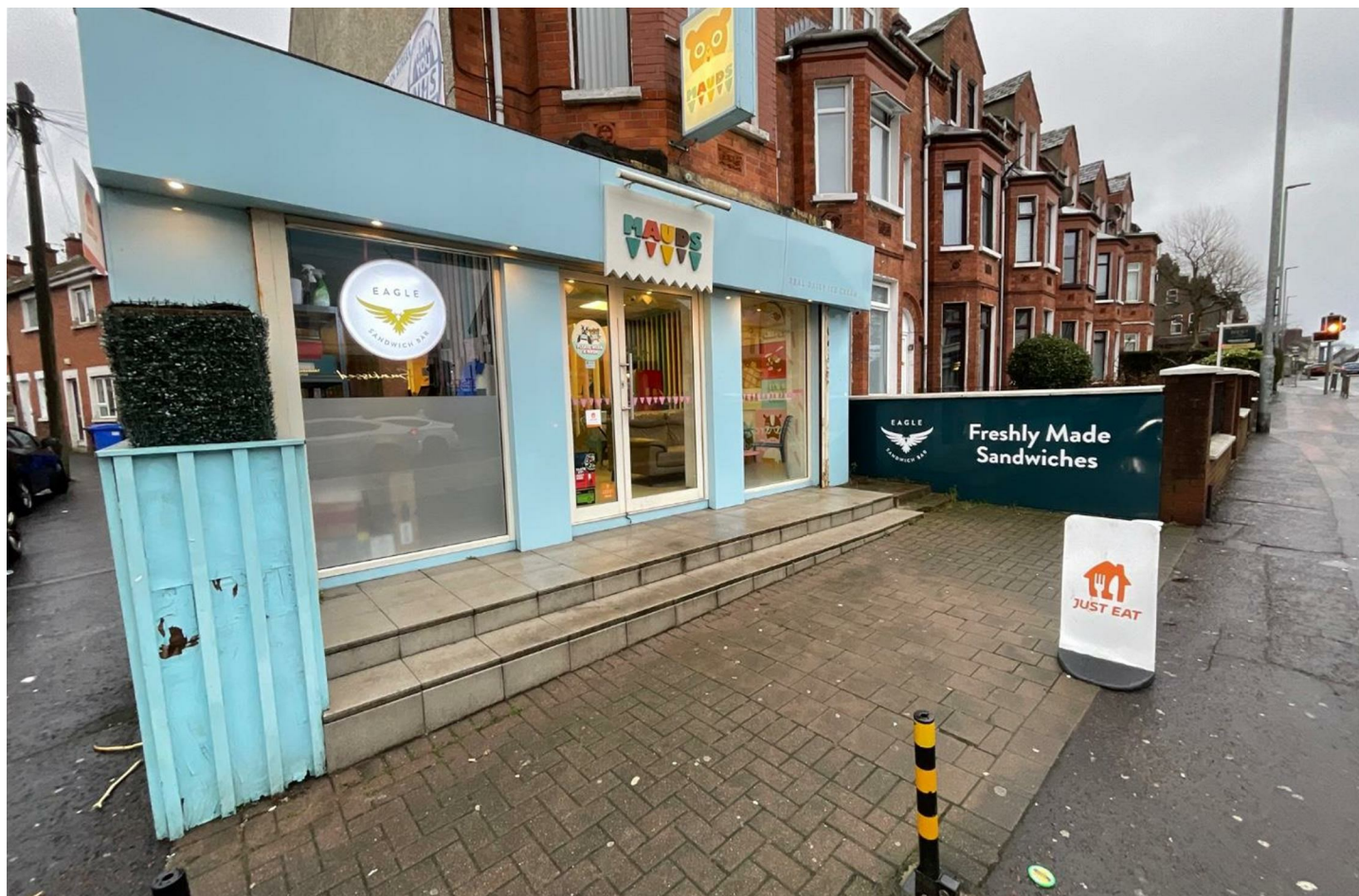
Mauds Cafe, 67 Ballygomartin Road Belfast, BT13 3LB