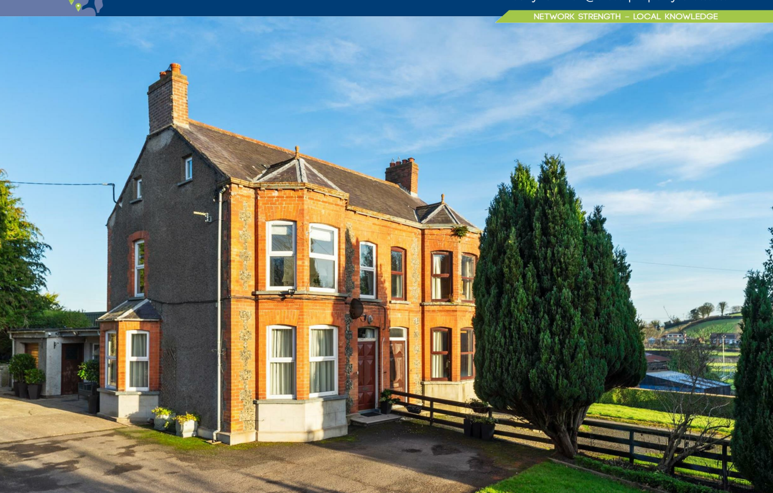
58 CHURCH ROAD, BALLYNAHINCH, BT24 8LP

bally nahinch @ulster property sales. co. uk