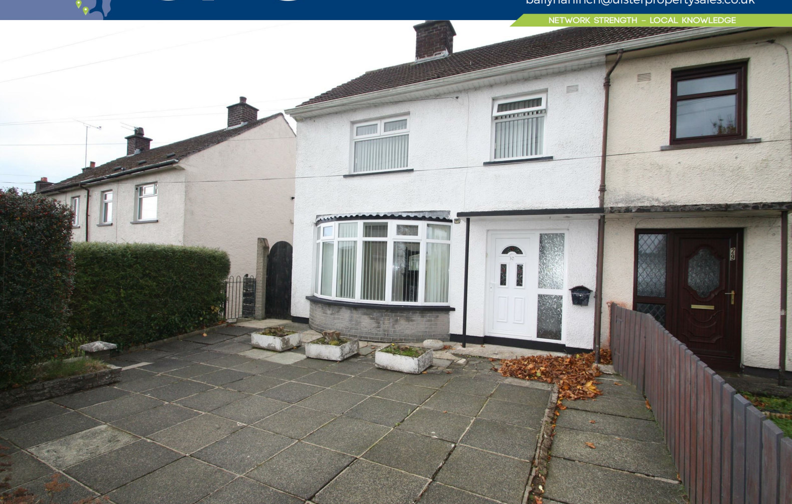
30 CROOB PARK, BALLYNAHINCH, DOWN, BT24 8BB