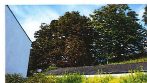
PHOTO 4 - EXISTING MATURE TREES/VEGETATION AT A HIGHER LEVEL ABOVE EXISTING GARAGES/OUTHOUSES TO BE RETAINED