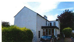
PHOTO 2 - EXISTING DWELLING NO. 8 STRANGFORD ROAD FROM PARKING AREA TO REAR.