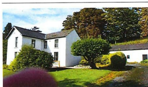
PHOTO 1 - EXISTING DWELLING NO. 8 STRANGFORD ROAD WITH OUTHOUSES TO REAR ON APPROACH ALONG EXISTING DRIVEWAY