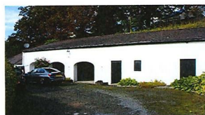
PHOTO 3 - EXISTING DWELLING NO. 8 STRANGFORD ROAD FROM PARKING AREA TO REAR.