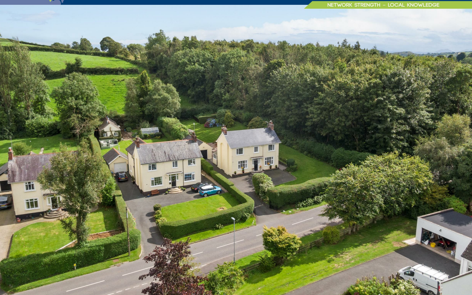
56 BALLYMAGLAVE ROAD, BALLYNAHINCH, DOWN, BT24 8QB