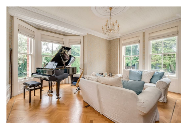
Ornate fireplace with cast iron inset and granite hearth, corniced ceiling, ceiling rose. Light oak parquet flooring, bay window.

DRAWING ROOM 17'1" x 16'6" at widest points (5.23 x 5.05 at widest points)