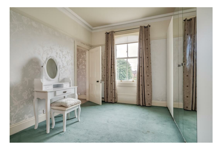
Corniced ceiling, picture rail.

DRESSING ROOM / BEDROOM FIVE 14'5" x 11'1" (4.41 x 3.38)