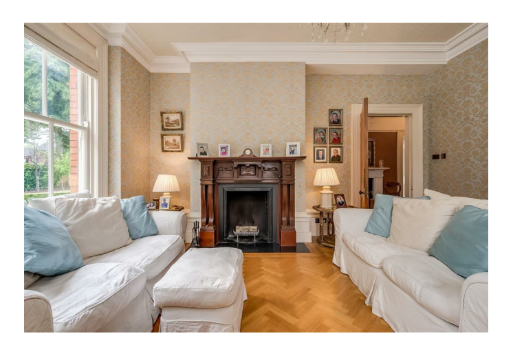
LIVING ROOM 29'5" x 14'5" (8.98 x 4.40)