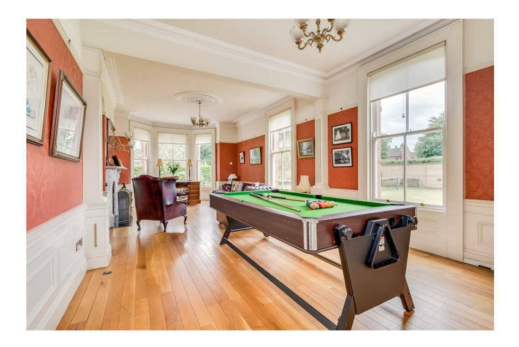
DINING ROOM 20'2" x 14'10" (6.16 x 4.53)

Solid oak flooring, Carrara marble fireplace with cast iron inset and granite hearth, corniced ceiling, ceiling rose, picture rail. Bay window. Part panelled walls.