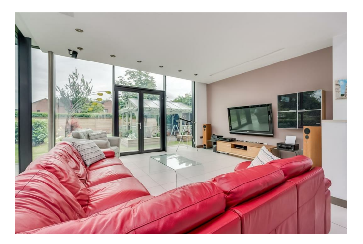
Tiled floor, glazed door to south facing garden, projector and surround wiring.